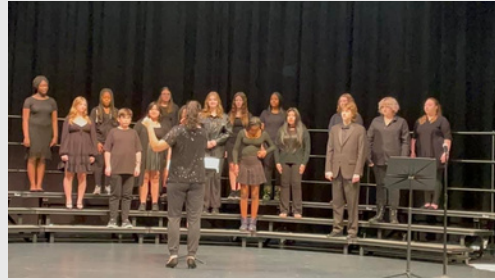
Crossroads MS Choir