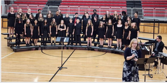
Creekside MS Choir