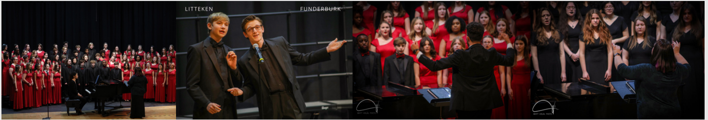
Freshman & High School Choirs