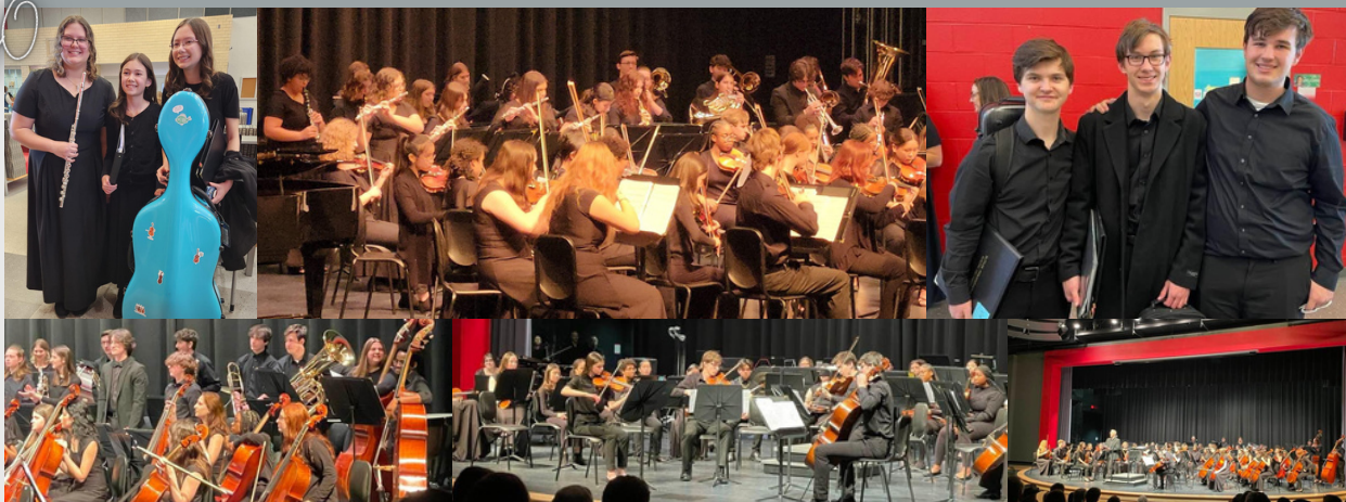
The Heartbeat finished off the season with Crystal Classic.