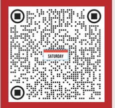
Calendar Day Adult Driver Sign Up