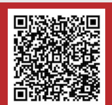
Football Concessions Sign Up