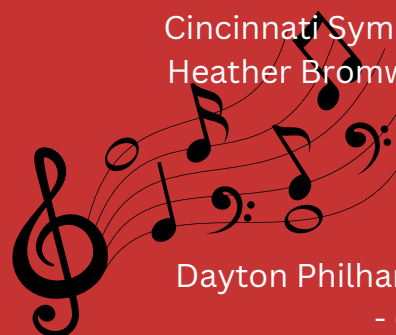
Dayton Philharmonic Youth Orchestra - Claire Lally