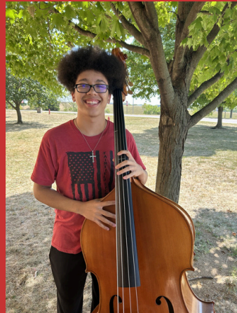
All State Orchestra