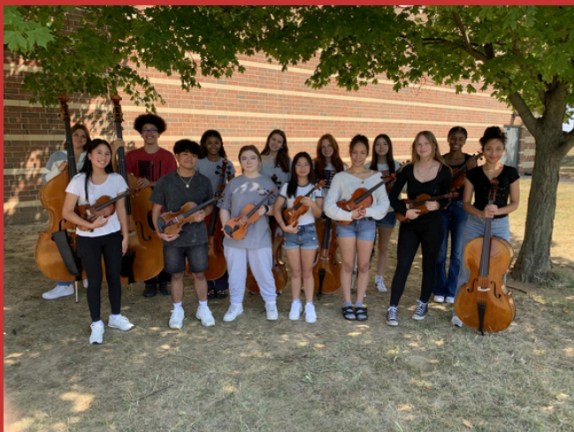
Butler Philharmonic Youth Orchestra