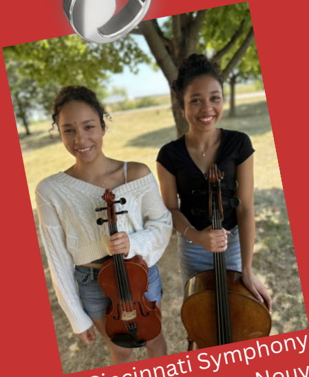
Cincinnati Symphony Youth Orchestra - Nouveau