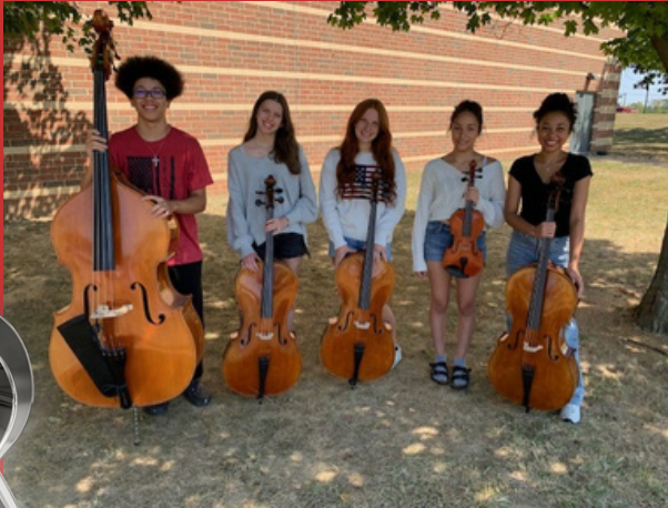
Southwest Region Orchestra